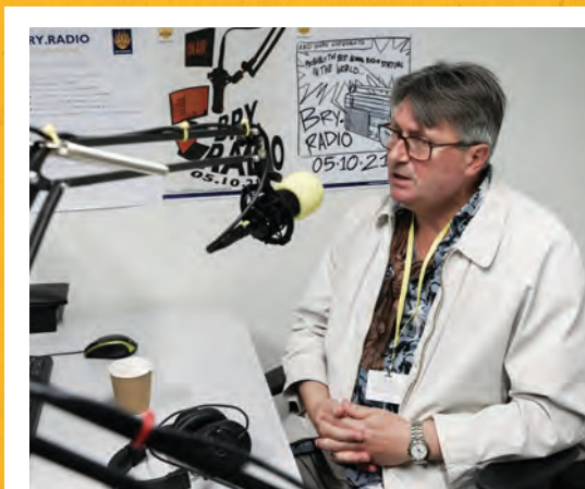
Poet Laureate, Simon Armitage

For all our pupils it helps them to go farther than they imagined they could go.