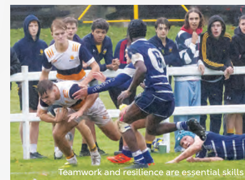
Teamwork and resilience are essential skills