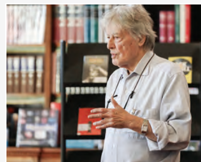
World class speakers like Sir Tom Stoppard.

Extra-curricular activities (ECAs) give pupils a range of ways they can develop their character, including resilience, confidence, leadership and independence. It is essential to preparing them for a successful adulthood.