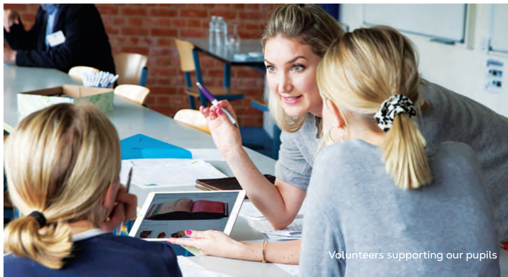
Volunteers supporting our pupils