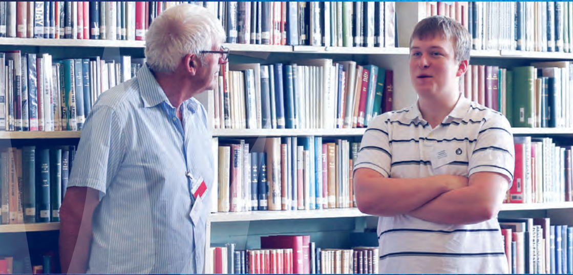
Two former Heads of School at Careers Day 2022