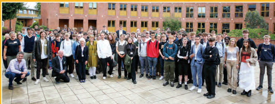
Green Conference in June, welcomed 100 visiting students from six local schools

In these pages of our annual report, we celebrate our benefactors and the remarkable impact they make to the educational journey of our pupils.