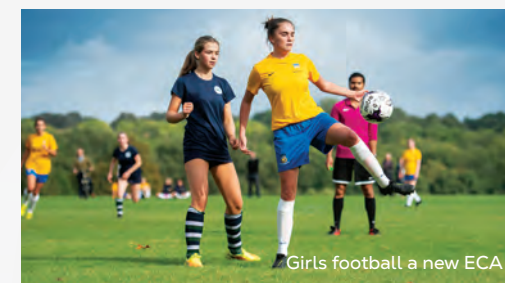
Girls football a new ECA