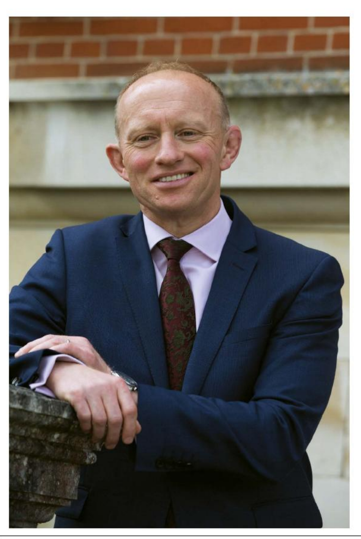
26 | ie-today.co.uk | @ie_today